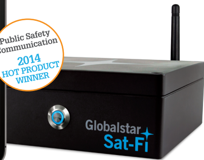
(Smartphones shown as an example and are not included with Sat-Fi)

Public Safety Communication 2014 HOT PRODUCT WINNER